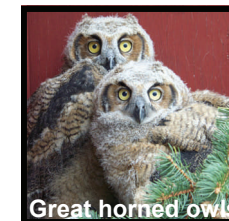
Great horned owls